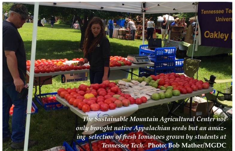
The Sustainable Mountain Agricultural Center not only brought native Appalachian seeds but an amazing selection of fresh tomatoes grown by students at Tennessee Tech.