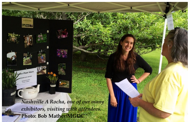
Nashville A Rocha, one of our many exhibitors, visiting with attendees.