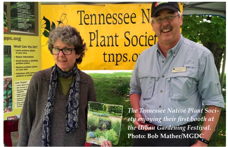
The Tennessee Native Plant Society enjoying their first booth at the Urban Gardening Festival.

Some of the new flowers, grown from seed, include Cleome, nasturtium, gaura, cosmos, Gaillardia (blanket flowers), along with such standards as marigold and Zinnia. These flowers have been placed in cleared areas on either side of the Pet Cemetery, but inside the semicircular path. Once the flowers start to bloom, we will provide a picture for a future newsletter. To volunteer or learn more, contact our "Zoo Crew" at grassmere@mgofdc.org .