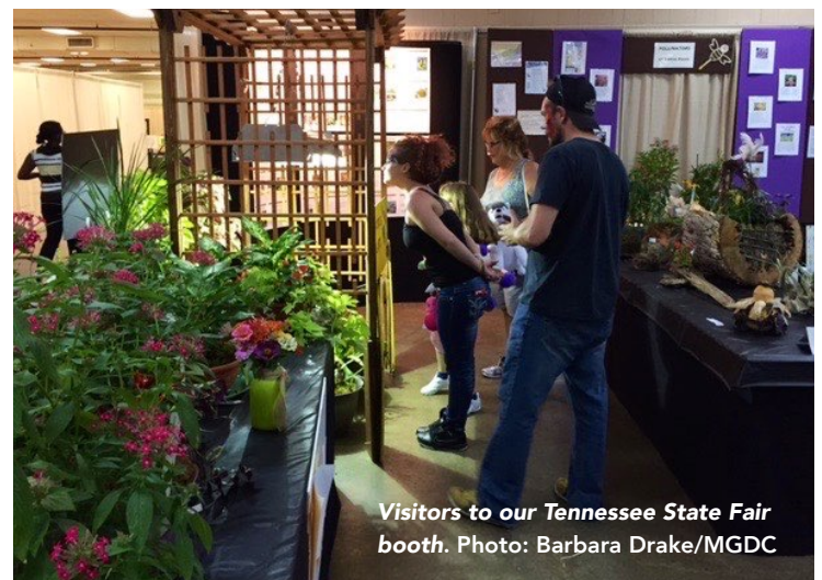
Visitors to our Tennessee State Fair booth.

Our visitors learned about THRILLER, FILLER and SPILLER. We had well over 300 ballots cast for our natural containers.