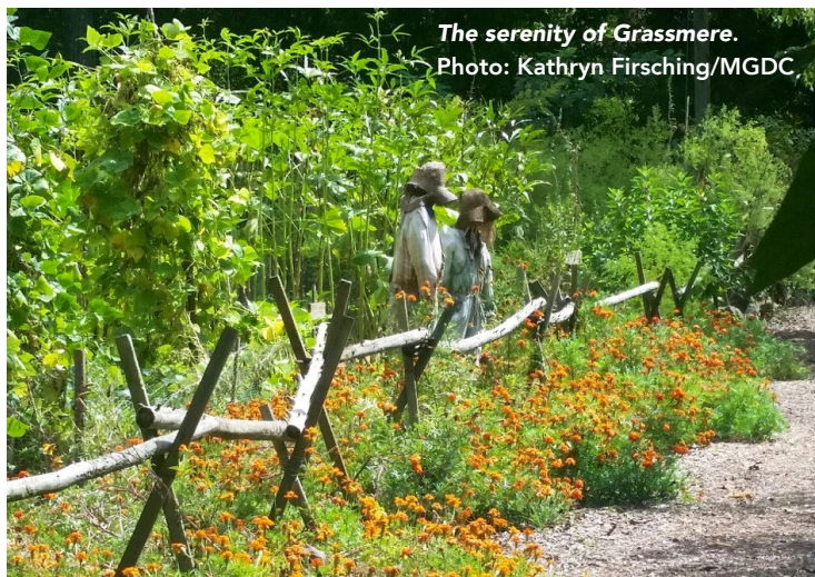
The serenity of Grassmere.

Bring an infusion of new energy and new ideas with you! Again, you can email your nominations to nominations@mgofdc.org . 🐾