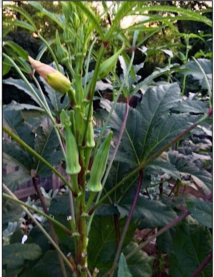
The okra crop comes in with a vengeance.