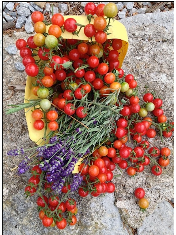
A lovely colorful harvest.