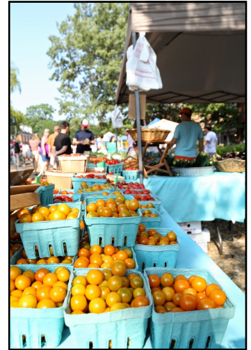
Produce stands at the Williamsburg farmers market.