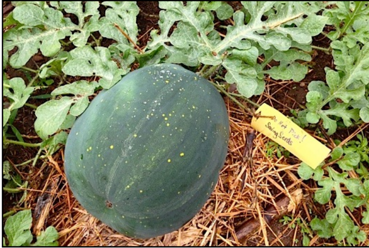
A Sun, Moon and Stars Watermelon maturing for seed saving.