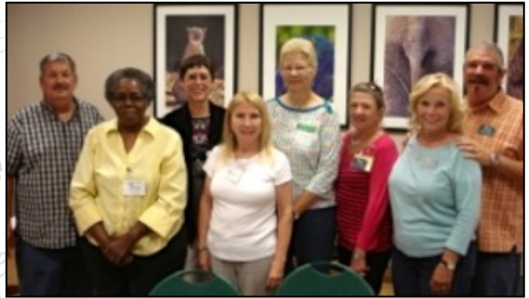
Just a few of our many Master Gardeners volunteering with the Speakers Bureau.