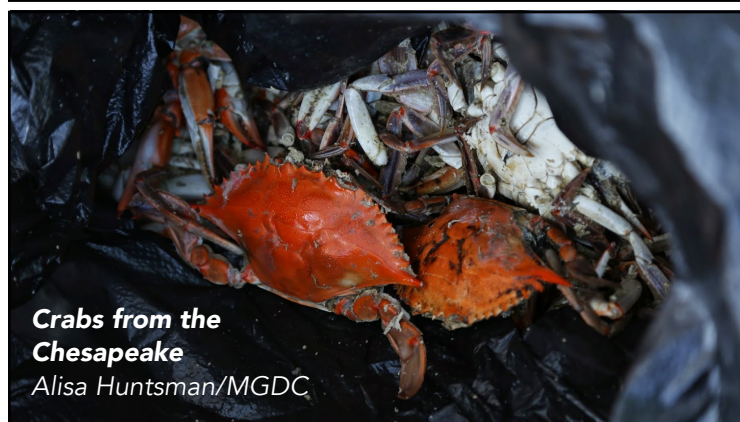
Crabs from the Chesapeake