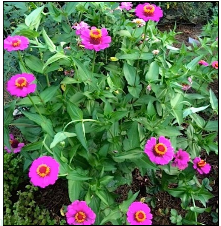
Fluorescent zinnias add vibrant color as the vegetables start to fade.