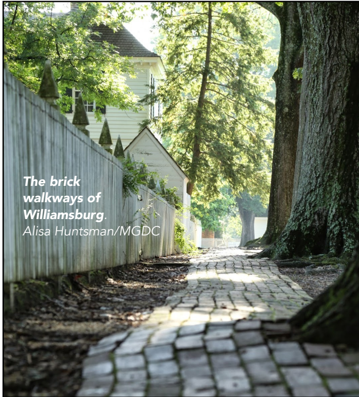
The brick walkways of Williamsburg.