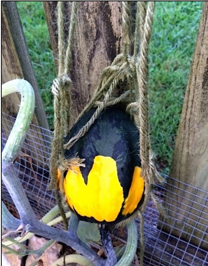
Our hopefully-prize-winning gourd, safe from rot or cracking in its cradle of twine.