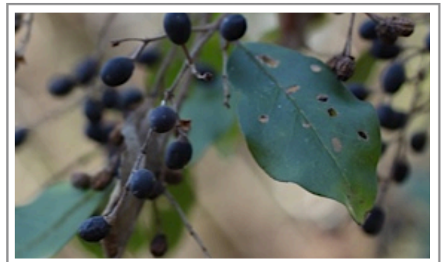
Like every other park, privet is invading the grounds and pushing out native species.