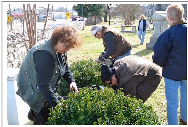
Master Gardeners at last year's Boxwood Trimming demonstration.

The 7 th Annual Boxwood Trimming at the Historic Nashville City Cemetery will be held on February 8 th and 22 nd from 9am to 1pm.