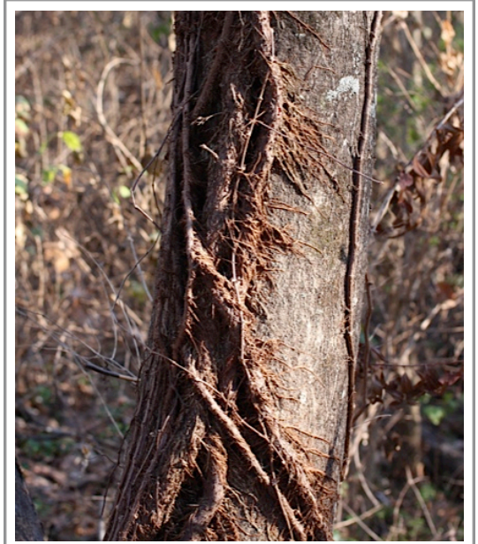
Poison ivy vine climbing a tree. The Center is full of poison ivy—be careful as you hike through.

http://www.tn.gov/agriculture/water/woodlands.shtml 🐼