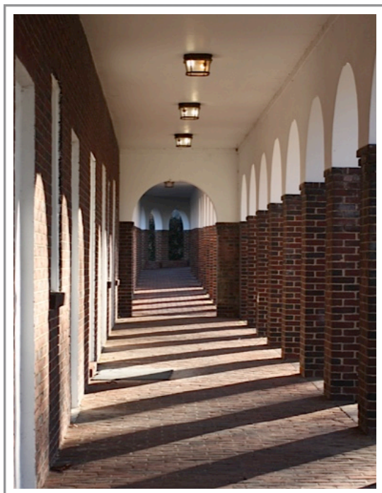
Covered walkway of Brentwood Hall, now Moss Administration Building.

In 1961, the state legislature voted to name the estate after Ellington. Around the same time, Governor Ellington moved the agricultural offices into the mansion. The agri-